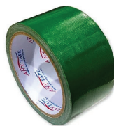
Duct Tape (Cloth Tape)