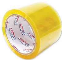
Heavy Duty Tape